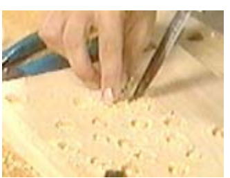
Pop them out with a knife