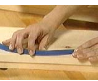
Use drawing aids to help get the shape

Draw a shape you like for the sidepieces. If you're feeling rakishly confident, mark the shape directly onto the board. If you're feeling tentative, draw the shape on cardboard first and cut it out so you're sure it looks okay. Trace the design onto the boards and cut them out using a jigsaw.