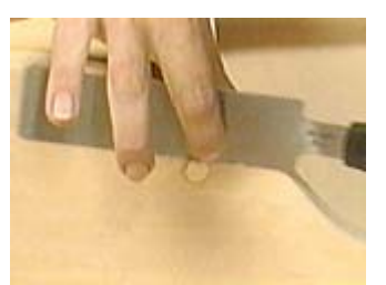
Cut off the plugs with a flush cut saw